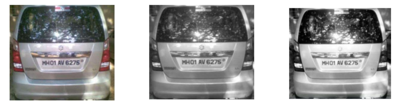
Fig. 2. (a) Loading of image, (b) Gray Scale Conversion, (c) Histogram Equalisation

Histogram Equalization has been utilized for upgrading the complexity inside the picture, which enhances nature of images along with the consequences of peak-related hustle. Such a significant number of strategies exist for binarization, that is one of the preprocessing method, is utilized to change over gray scale picture into a parallel picture and is used to column the values inside the Vehicle Plates and to smother the foundation points of interest. In Otsu dynamic binarization strategy [9] [10], the picture is divided into sub-districts and to limit associate incentive for every sub-locale is discovered here, that we glance for the sting that limits the intra-class amendment, characterized as a weighted entireness of fluctuations of categories which provides two areas of the image. Edge detection [10] [11] [12] includes the following pre-processing step, which identifies minor differences in picture figure 2 brilliance and in Characteristics of the protest. The vertical fringes made by the License Plate characters are separated by Sobel fringe recognition administrator [5] [12]. Other outline identification administrators are Roberts [6], Canny [6] and Prewitt [13] administrators.