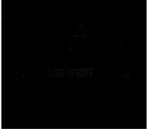
Fig. 4 Count of edge esteem

Where and high are the gray level parameters of the window.