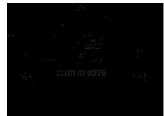
Fig. 5. Auxiliary Component is utilized as a part of convolution with the picture

The expansion procedure will set the foundation pixel to be closer view if there is a piece of the organizing component that achieves the forefront when the focal point of the organizing component still out of sight territory.