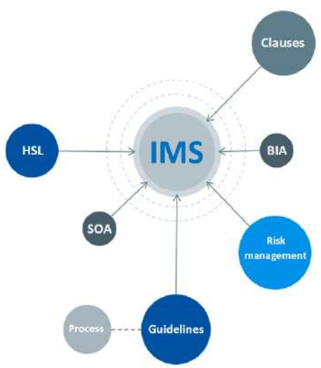
Figure 7 GIS integration model proposal

The architecture proposed for the integration of the management systems will strategically understand the benefits of the ISOs involved, guaranteeing the security information and the continuity of the commercial activities from the organization through the adequate risk management, a general map of the structure proposed for the GIS and the main requirements for its implementation is showed: