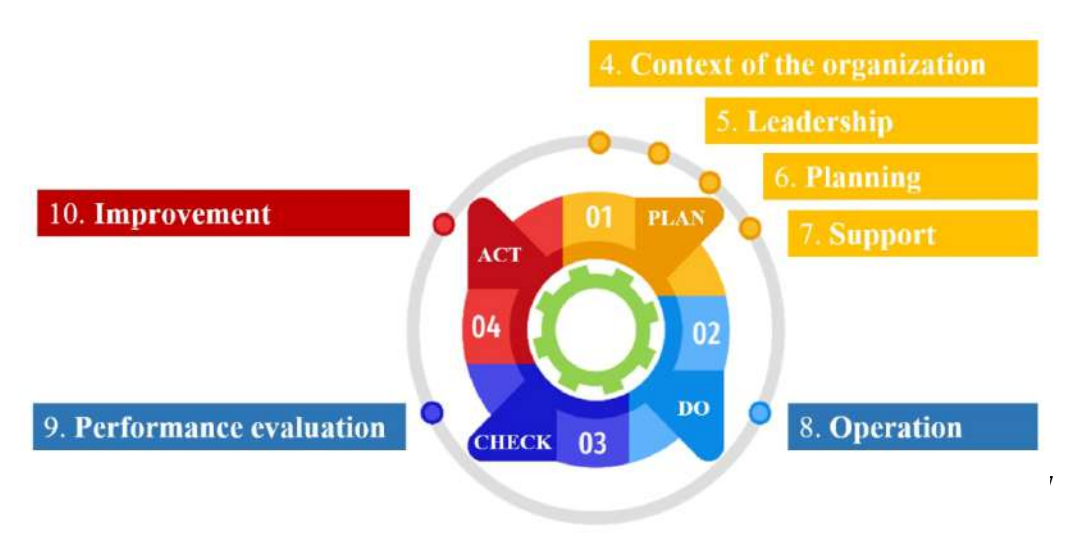
Figure 4 Deming cycle applied to standards integration

It is appropriate to declare confidently through the risk management, there is congruence with ISO 27001 (information security), ISO 22301 (business continuity), cybersecurity and, consequently, the information technologies, being a key point for the integration based on similarity and standardization criteria's, and as a result from the analysis performed for the methodologies related with the researching, it is concluded that the PDCA methodology is a holistic approach and is keeps consistent relationship with factors established in the integration. As shown in Figure 4.