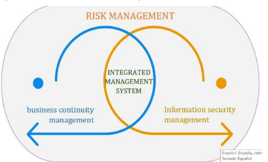
Figure 6 Practical factors involved in the cohesion of S.I.

In the same way as shown in Figure 6, the practical form of integration includes factors which contribute to the congruence of information systems, such is the case of risk management, which is valued in the Security Information Management System and in the Business Continuity Management System. According to the framework of the proposal, which should integrate standards based on safeguarding the information and guaranteeing the persistence of business activities and is necessary to establish convergence criteria, such is the case of Risk Management.