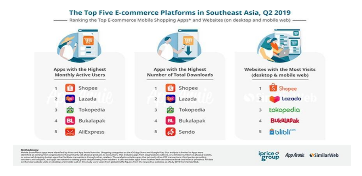
Figure 1: The top five e-commerce platforms in Southeast Asia (EcomEye 2019.)

With a solid foundation from the firm's mother company, Sea Corporation, and a co-founder who was named one of Asia's top ten leaders in retail, the company has a wealth of experience. (2019, EcomEye.) In comparison to its competitors, Shopee has a strong customer base. Malaysian e-commerce websites have some of the highest levels of online traffic in the world. According to Statista, Malaysia was rated second in the world's fastest growing grocery market list for 2018 and will have a market share of over 60% by 2022, see Figure 2.