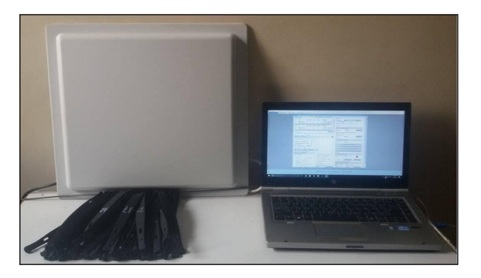
Figure 2 shows the real-time test results of the system. The output attendance sheet for a group of employees shows the Electronic Product Code (EPC) for each attendant, his name, the date and time of place work entry. The RFID system automatically gets the accuracy, and error rate in real time.