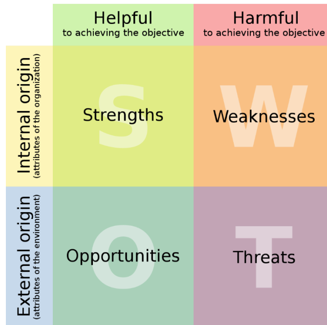
Figure 2 SWOT Analysis Factors

Analysts present a SWOT analysis as a square segmented into four quadrants, each dedicated to an element of SWOT. This visual arrangement provides a quick overview of the company's position. Although all the points under a particular heading may not be of equal importance, they all should represent key insights into the balance of opportunities and threats, advantages and disadvantages, and so forth.